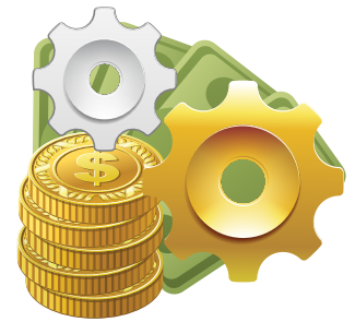
Take Control of Your Spend

"User adoption is the single most important factor in an eProcurement project. No user adoption means no visibility and no control"