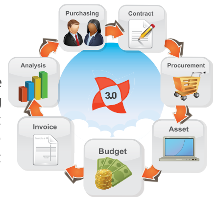
b-pack Automates Your Entire Purchase-to-Pay Cycle

eProcurement is the most direct and effective way for an organization to reduce costs, improve productivity and boost profits. It automates and streamlines your purchasing processes by creating a web-based, self-service environment that pushes product selection and order initiation to your employees' desktops while maintaining corporate trading agreements, approval workflows and authorization rules. Your purchase department now focuses on upstream activities such as supply source development, negotiation and supplier management.